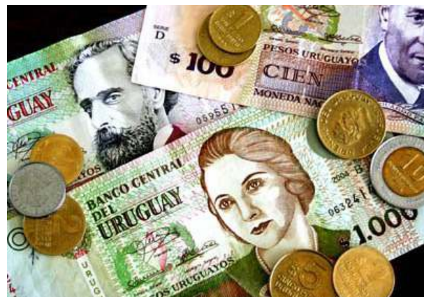
Uruguayan peso.