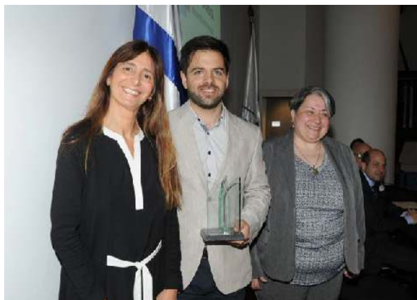
Uruguay's FBD project wins the First Prize for Transparency in Administration.

An evaluation of the social inclusion projects between 2011 and 2014 showed that, after 12 or 18 months, 50% of referees were employed – 72.7% of them in the formal economy. Regarding drug use, 66% were no longer using drugs, 24% used sporadically, and 10% reported that they consumed as much or more than before. 7