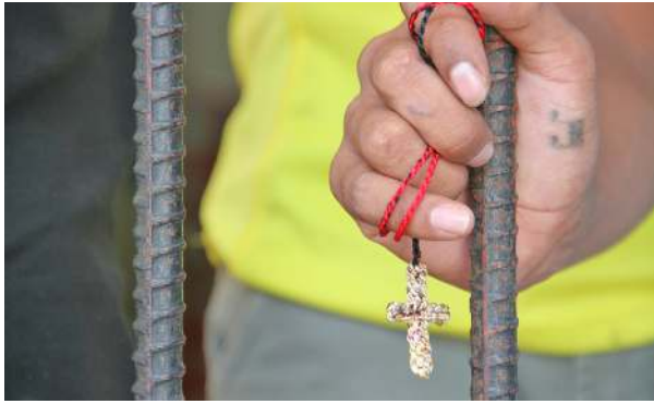
Woman incarcerated in El Inca prison, Ecuador.

producing a decline from 18,675 people incarcerated in 2007 to 10,881 in 2009.” 7